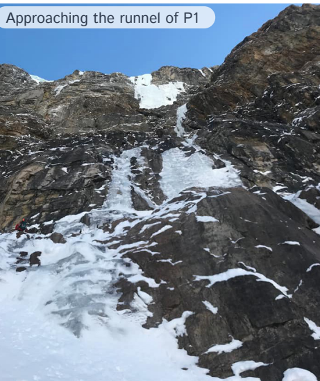
Approaching the runnel of P1