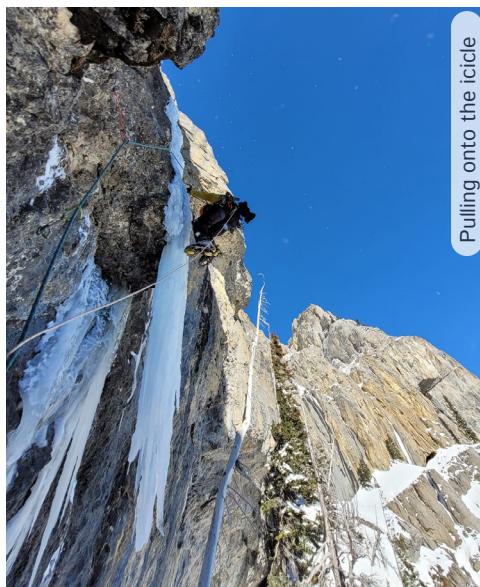
Pulling onto the icicle