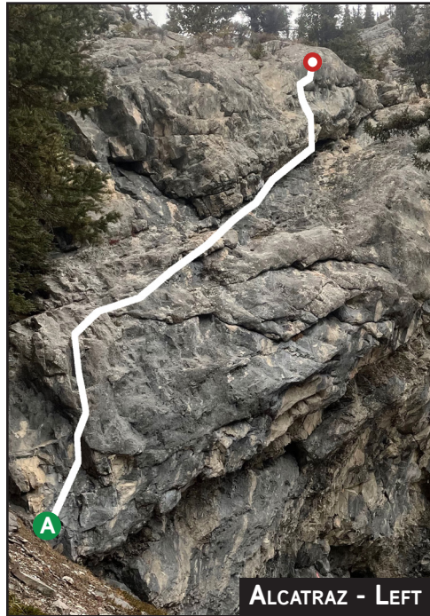
ALCATRAZ - LEFT

A Juvie D5+ 17m 8 bolts Left of Party at the Penitentiary , find a short corner above the side of the hill, and make a few moves up to the fixed draw. Traverse right on good natural hooks and thin feet and pull up to the base of a long crack between the slab and face above. Make a few moves along the slab, then step up and climb to an anchor above the break. Prep: Greg Barrett FA: Gavin McNamara, Nov 2022